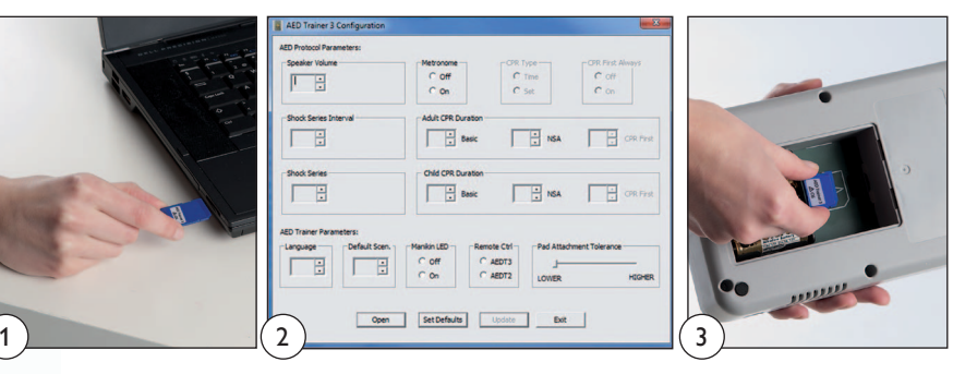
Insert the Operating System Card into a PC