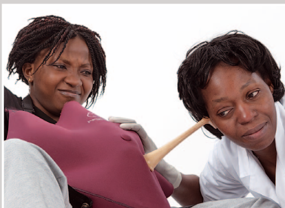
Fetal heart rate monitoring