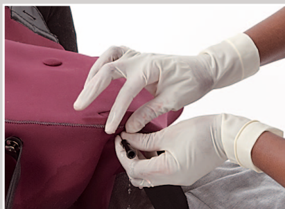
Urine bladder catheterization