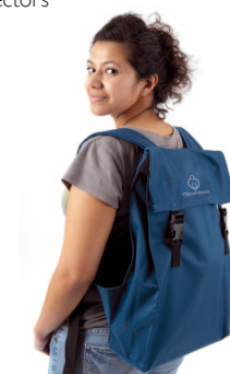
MamaNatalie comes with a bag for convenient transport