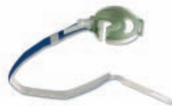
Thomas™ Tube Holder