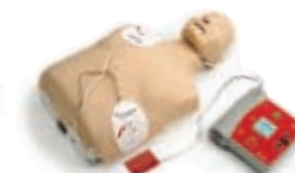
AED Little Anne™ Training System