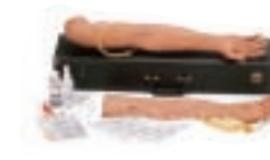
Multi-Venous IV Training Arm Kit