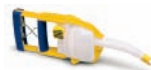
V-VAC™ Manual Suction Unit