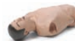
AT Kelly Torso