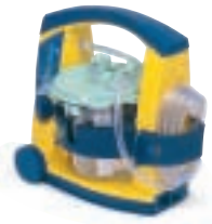
Laerdal® Suction Unit