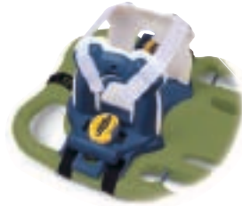
SpeedBlocks® Head Immobilizer