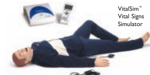
MegaCode Kelly VitalSim™ Advanced