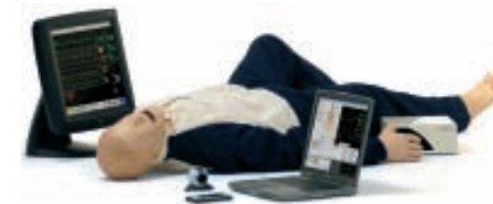
Laerdal® SimMan® Universal Patient Simulator