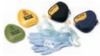
Laerdal® Pocket Mask™