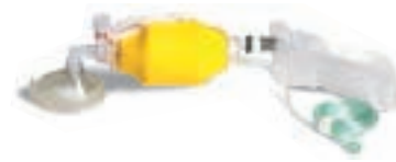
The BAG™ Disposable Resuscitators