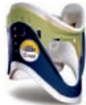
Stifneck® Select™ Extrication Collar