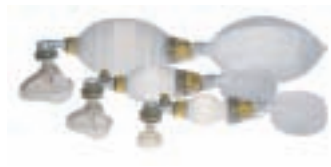
Laerdal® Silicone Resuscitators