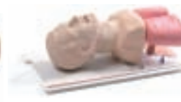
Laerdal® Airway Management trainer