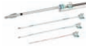
Trachlight™ Stylet and Tracheal Lightwand