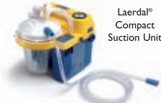
Laerdal® Compact Suction Unit