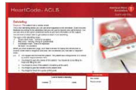
The debriefing screen details correct and incorrect actions, provides suggestions for improvement, and incorporates direct links to the appropriate reference material.