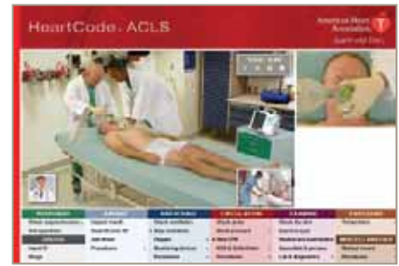
HeartCode ACLS includes micro-simulation technology that improves both the educational content and user-friendliness of the program.