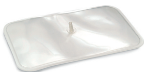
38 04 35 Breathing Bladder