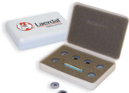
200-03050 Set, Pupils