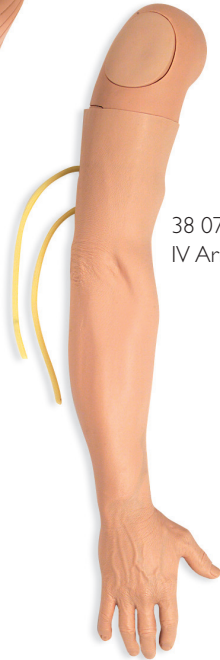
38 07 00 IV Arm, right