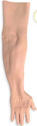
31 20 29 Skin & Veins, IV Arm