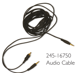
245-16750 Audio Cable