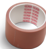
200-00250 Cricothyroid Membrane Tape (1 roll)