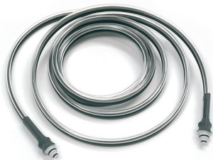
38 10 10 Tubing Assembly Compressor-Manikin, Air/CO 2