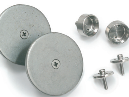
38 04 10 Post Set, ECG/defibrillation