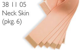
38 11 05 Neck Skin (pkg. 6)