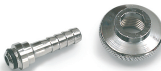
38 12 01 Jet-Vent Adapter Kit