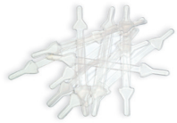
38 11 02 Fastener for Neck Skin (pkg. 10)