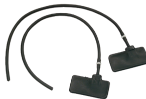
38 04 06 Bladder Set Mid-Auxillary (Pneumothorax Side)