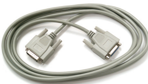
38 03 10 Cable Assembly Manikin-Link Box (15 pin D-sub)