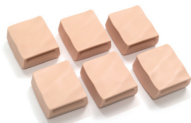
38 31 10 Chest Tube Insertion Modules (pkg. 6)