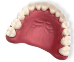
38 11 06 Teeth Upper Rigid (polyester)