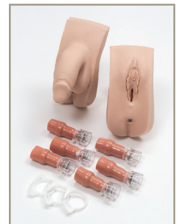
38 04 61 Kit Adult Female Genitalia w/Valves