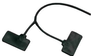
38 04 05 Bladder Assembly Mid-Clavicular (Pneumothorax Chest)